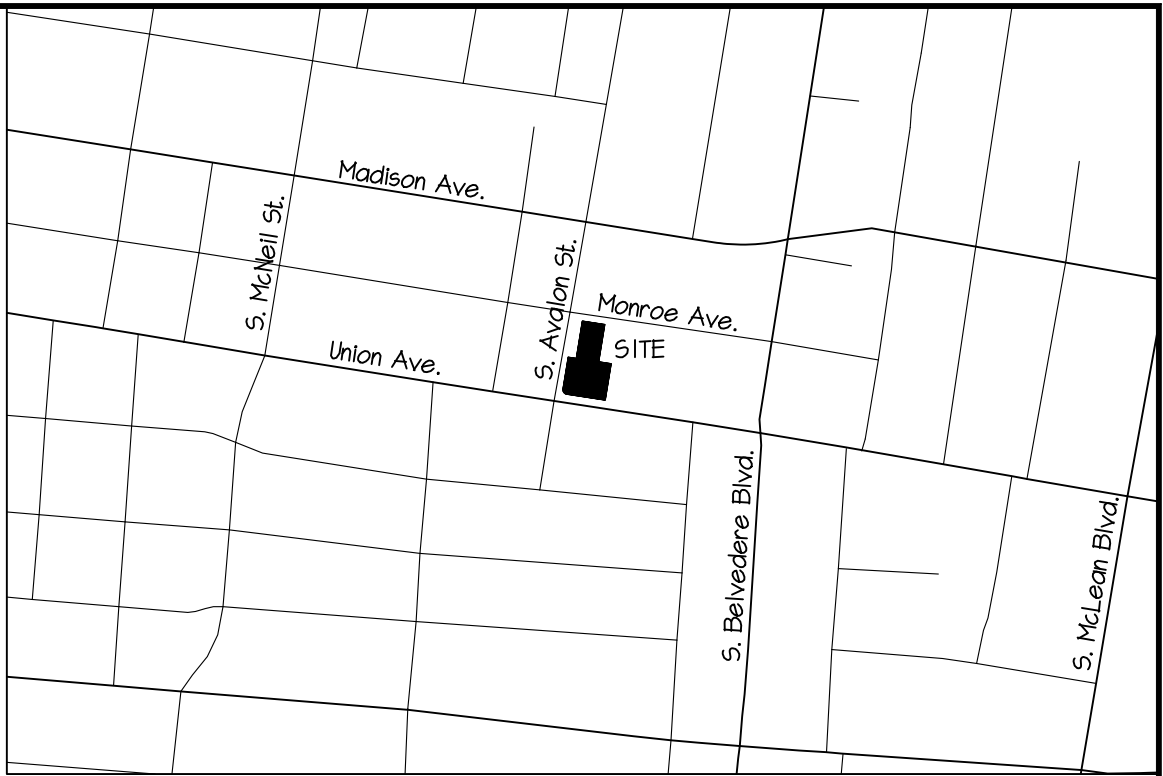
Vicinity Map nts

Lot 3, Block 2 Ingleside Sub. Plat Book 2, Page 100